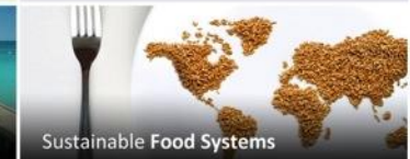
Sustainable Food Systems

Learn about and share latest news and events on SCP initiatives worldwide