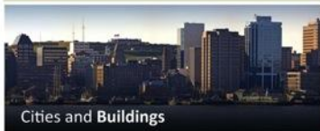
Cities and Buildings

Serve as the information hub for the 10-Year Framework of Programmes on SCP (10YFP)