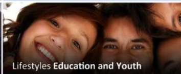
Lifestyles Education and Youth

Inspire policy-makers, the business sector and civil society around the globe to share experience and take action